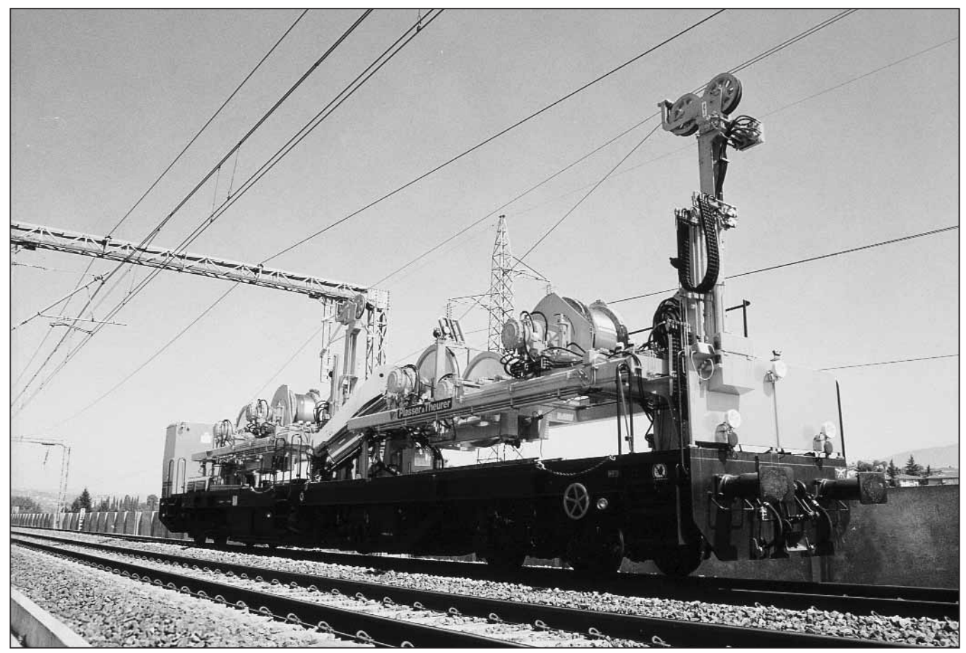
Fig. 1: The FUM 100.128 catenary renewal machine of DB Bahnbau GmbH

After thorough investigations, DB Bahnbau GmbH opted for the FUM 100.128 catenary renewal machine (Fig. 1) which, in a single working pass, can install contact wire and carrying cable immediately with the final operating tension and in the correct stagger. DB Bahnbau GmbH believes that this new machine, as the core of its catenary renewal train, meets today's modern demands with respect to the replacement of overhead lines. Specially developed and adapted for conditions on DB AG, the FUM 100.128 catenary renewal machine has been in operation in Germany since February 2003.