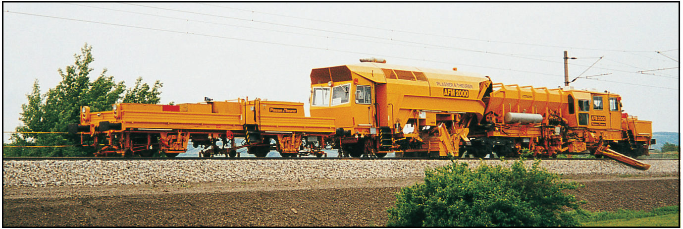
Plasser's AFM 2000 automatic track finishing machine in operation on Austrian Federal Railways' network.

The rotating sweeper brush is powered hydrostatically with optimum turning capacity at high torque and with stepless speed adjustment. A rapid change system allows speedy conversion of the brush shaft, enabling rapid reaction to the prevailing sleeper shapes or the need for lower sweeping in sleeper cribs between the rails.