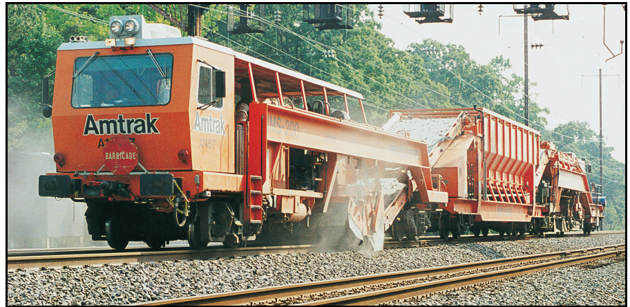
This Amtrak machine has a material conveyor and hopper unit to increase capacity.

A laser scanner acts here as a non-contact measuring system, scanning the track in two dimensions. When the laser pulse hits the ballast profile, it is reflected and registered in the laser receiver. The contour of the ballast profile is calculated from the sequence of pulses received and the evalua-