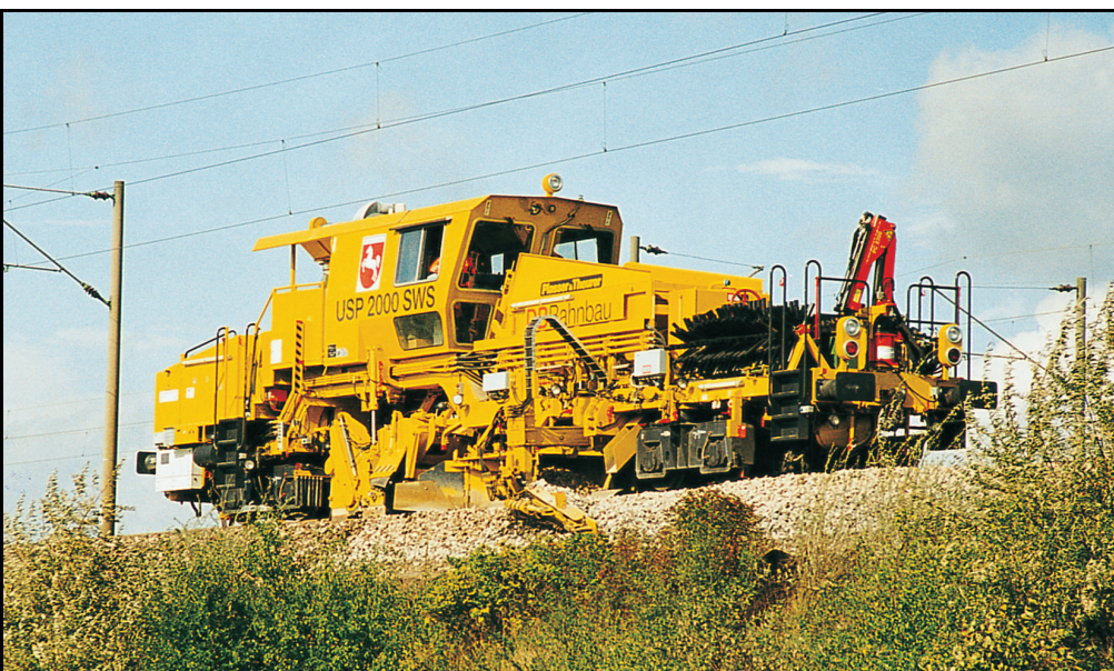
A universal ballast distribution and profiling machine operated by DB Bahnbaud.